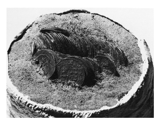
Fig 4. Hoard including 205 Arabic coins, found in 1984 during archaeological excavations and excavated in the laboratory. The coins were originally deposited in some container or bag of organic material which had disintegrated. The same year a hoard consisting of three bracelets and a finger-ring was found close to the coin hoard. Prior to this several other hoards of coins and jewellery were found on the same site. Häffinds, Gotland, Sweden, KMK 101 274.

Also in this respect the hoards and other types of graves and burials resemble one another: their content was delimited by the terms of the time, place and culture in which they were created, but not defined or determined by it. The two phenomena are equally evidence of how humans always act out of persuasion, not knowledge, and of their conviction there is something larger than our own present reality.