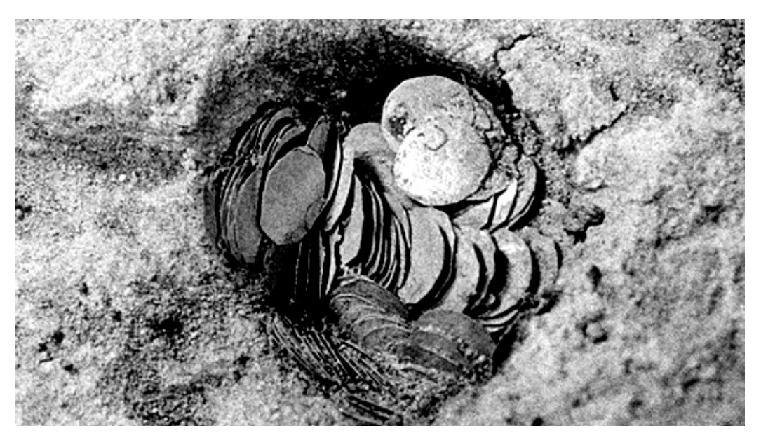
Fig 5. Hoard including coins, pieces of silver and a pendant. Found in a cultivated field in 1991 and excavated in the laboratory. The hoard was deposited in a tubular container of organic material. Mannegårde, Gotland, Sweden, KMK 102 086.

graves is accepted, the hoard itself should be regarded as such a recreated and reintegrated body.