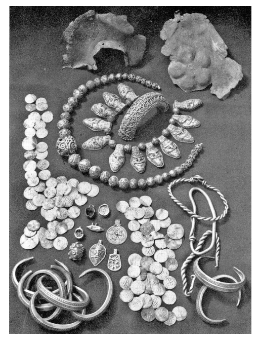
Fig 1. Hoard including coins, beads, pendants and bracelets. Found in a copper bottle of oriental type in 1866 by Johannes Nilsson, while he was digging a ditch in a meadow to be cultivated. Fölhagen, Gotland, Sweden, SHM 3547.

composition and depositional contexts are as important clues to the situational decisions and the specific reasons leading up to the event of hoarding itself (cf. Myrberg 2007, 2008:49, 2009).