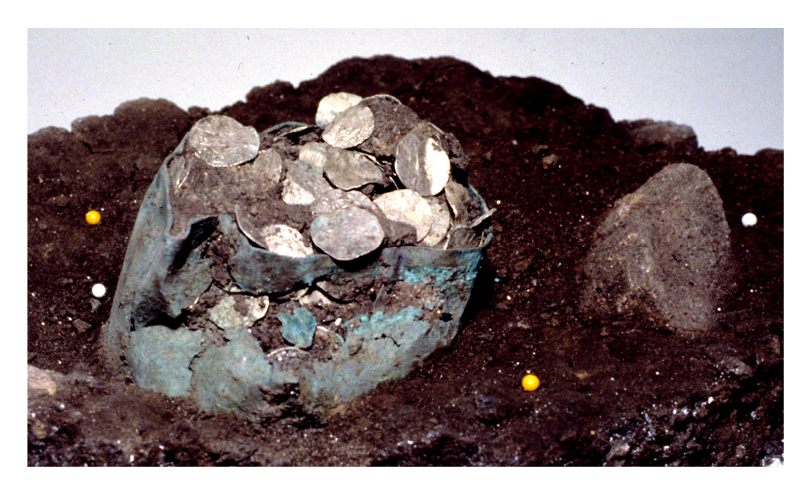
Fig 3. Hoard including more than 1300 coins, found in a bronze container in a cultivated field in 1989 and excavated in situ. Stumle, Gotland, Sweden, KMK 101 844.

the correlation "retrieved container – found in an arable field – both coins and objects included in the hoard" (Myrberg 2008:129-130, table 5.6.3). As far as the medieval hoards are concerned, a correspondence between "grave-like context" and hoard with objects may be detected. The number of coins also appears to follow a certain pattern, where few coins and more objects correspond with an accentuated "grave-like" context, while a large number of coins and few objects are normally found in hoards